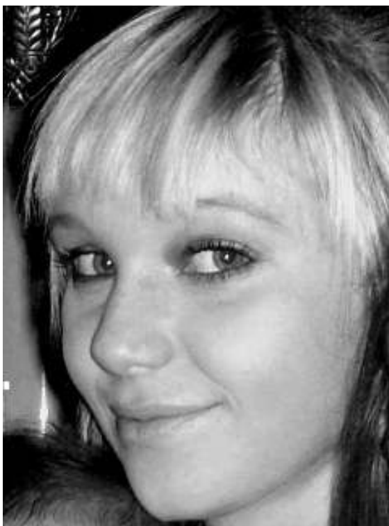
Cape Town, South Africa, Annual Family Law Conference Presentation – 12 March 2009.

I would like to start by quoting the preamble to the Constitution of the Republic of South Africa, which came into effect on 4 February 1997: